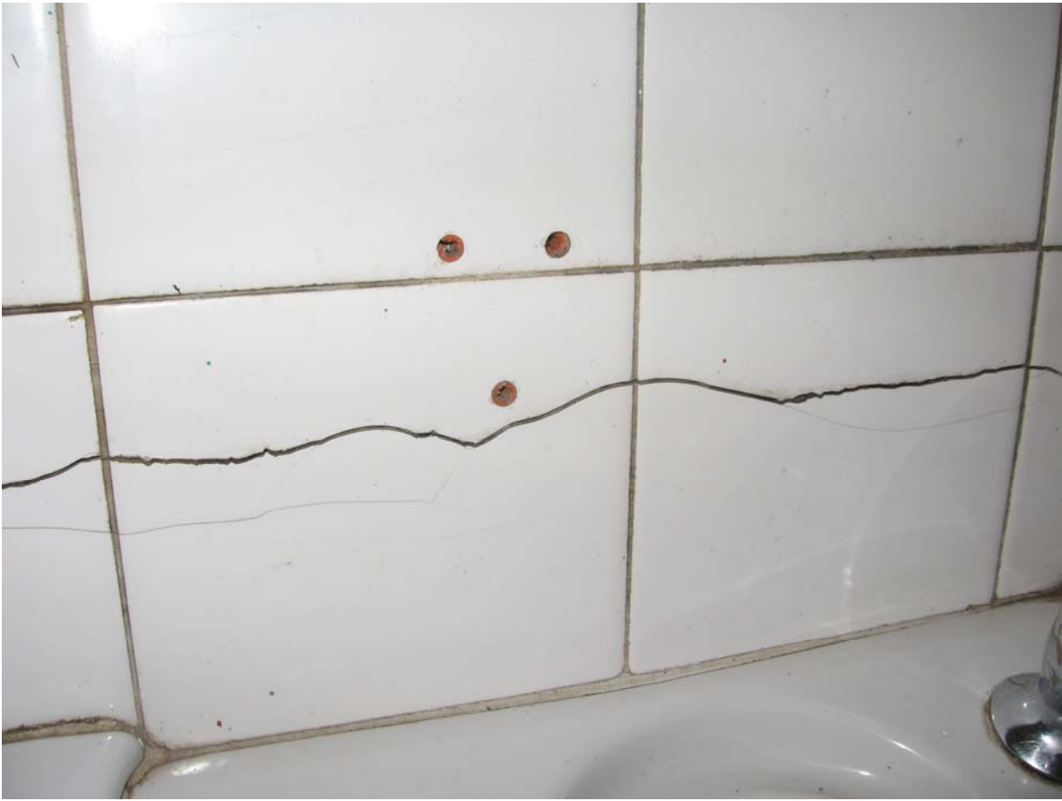
Fig4: Drilled holes and cracks repaired and re-enamelled in high-gloss white