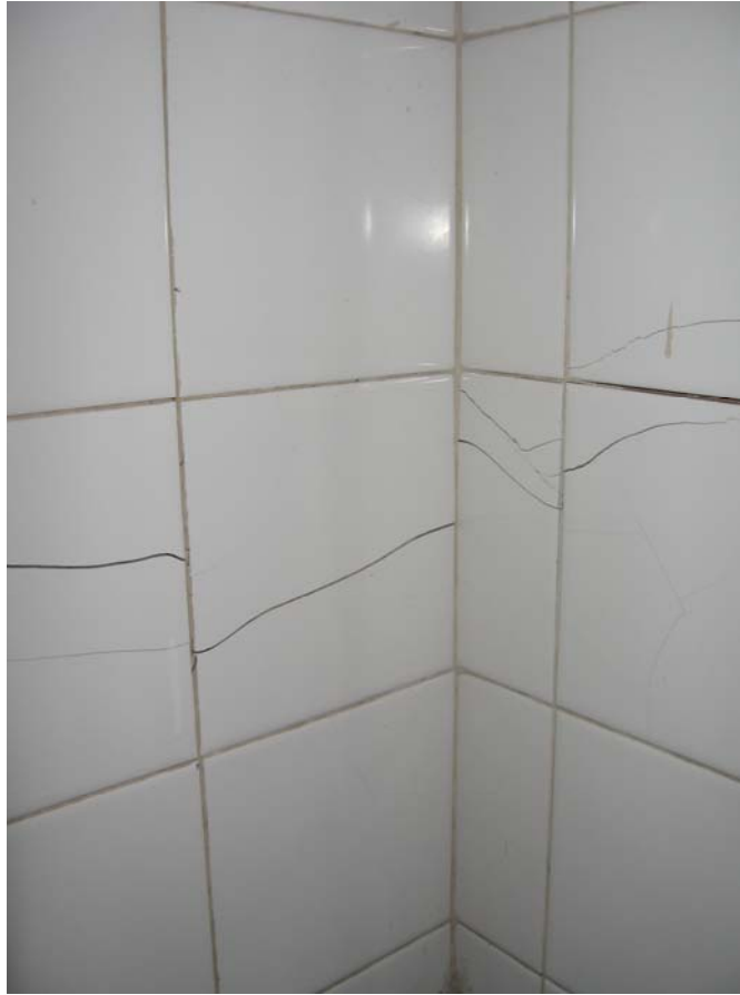
Fig4: Cracked tiles repaired and re-enamelled