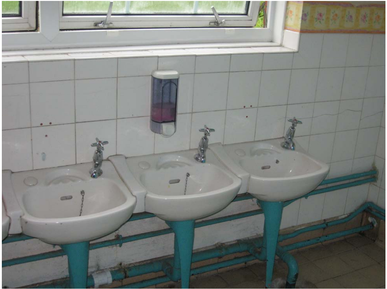
Fig1: Drilled holes/cracks in tiles repaired and handbasins repaired and re-enamelled in high-gloss white