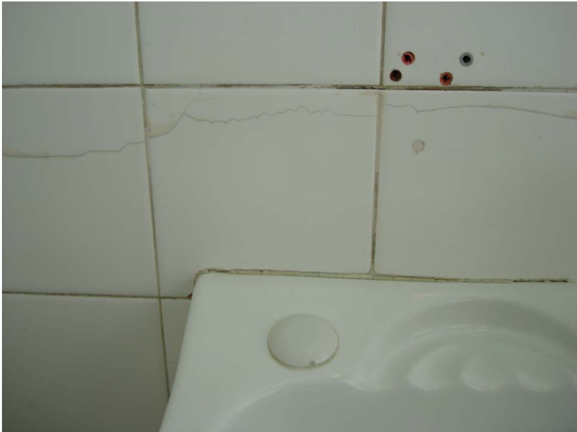
Fig7: Before and After