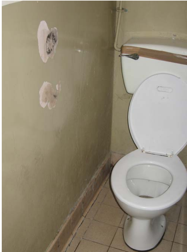
Fig8: Toilets repaired and cubicles resurfaced in fleck granite effect