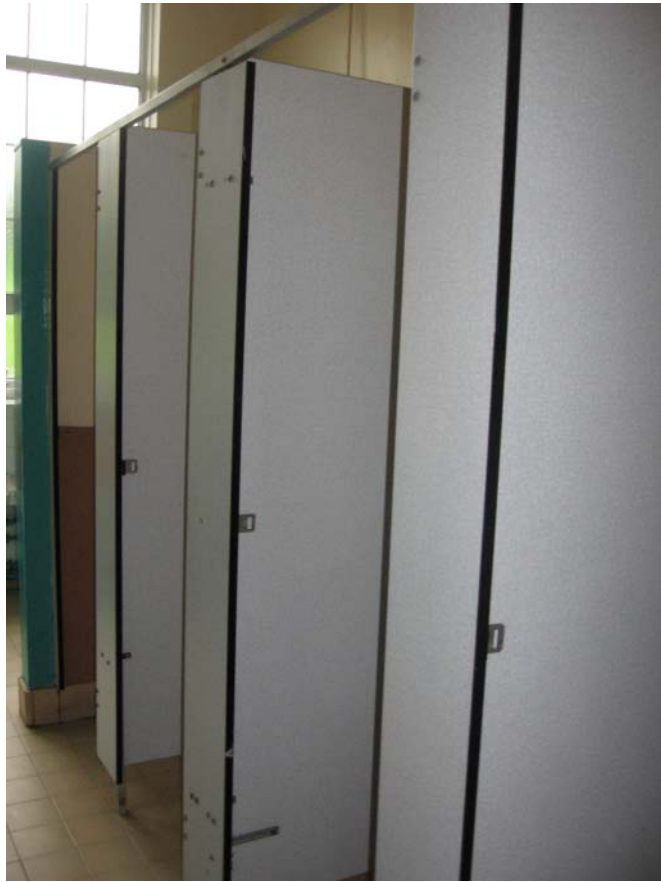
Fig11: Before and After