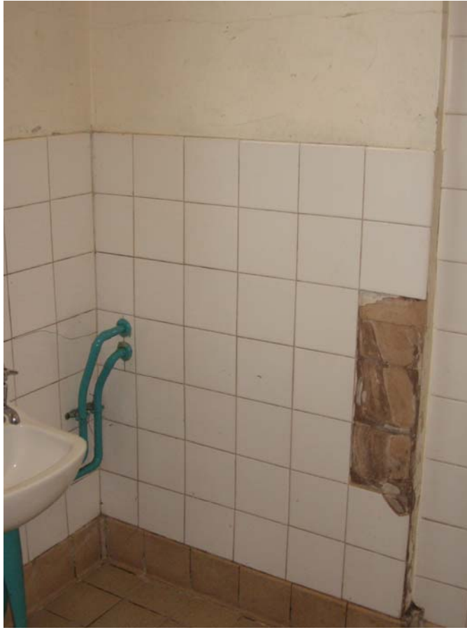
Fig10: Before and After