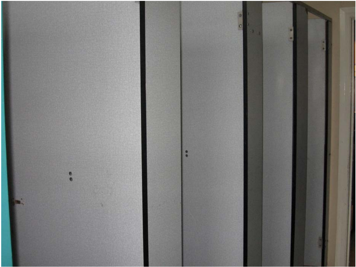
Fig2: Toilet cubicles repaired and resurfaced in pink fleck granite effect