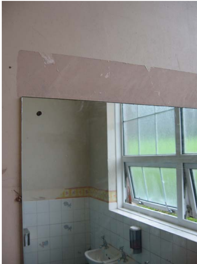
Fig9: Before and After