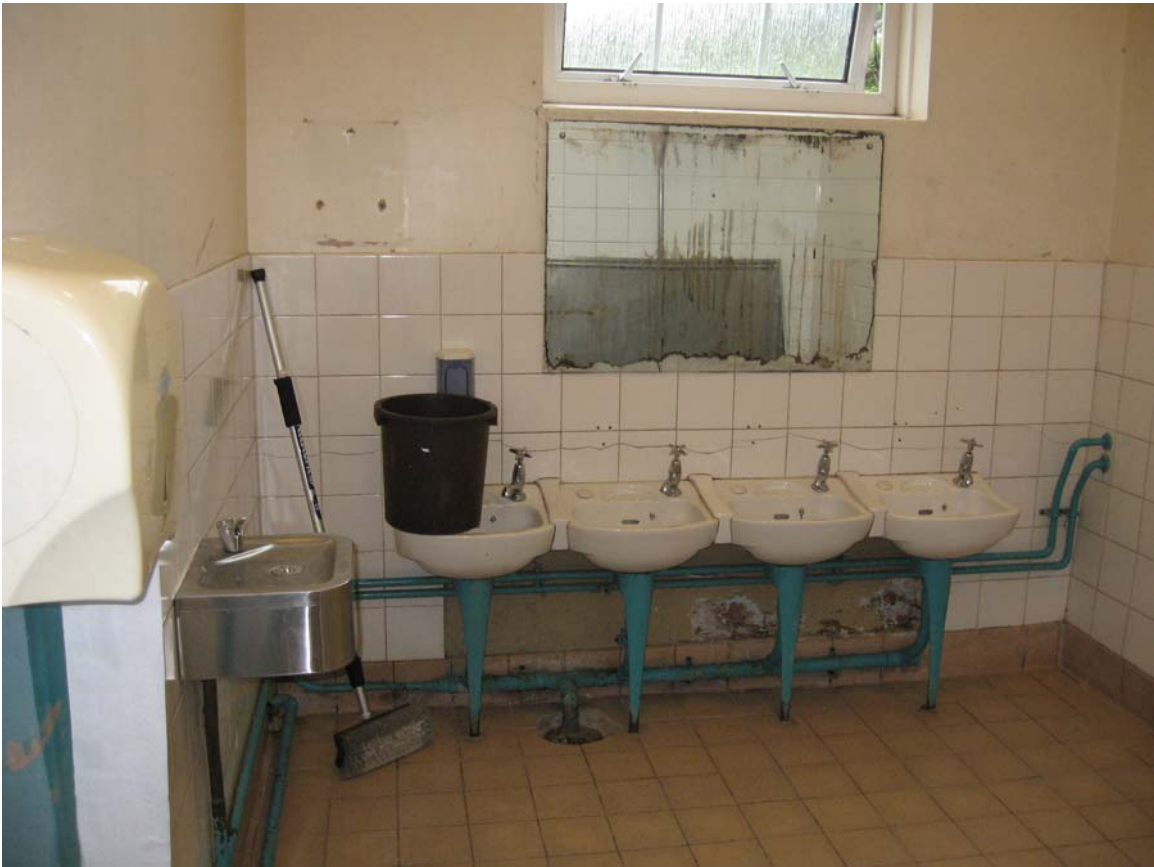
Fig6: Before and After