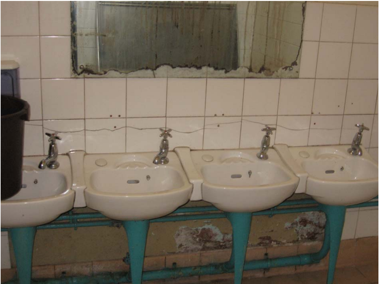
Fig3: Cracked tiles, chipped and tired handbasins re-enamelled in high-gloss white